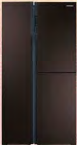
Side by Side Fridge with Twin Cooling Plus™ (RS554NRUA9M) 590L