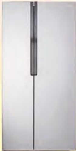
Side by Side Fridge with Twin Cooling Plus™ (RS552NRUASL) 584L